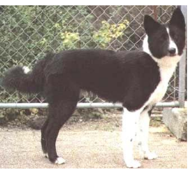
Karelian Bear Dog. Some cases of GSD pituitary dwarfism have been found in this breed, but that is because there is some