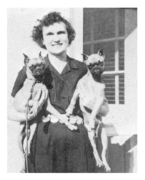
Miniature Boxers. Proportional, but not dwarfs. It is possible to miniaturize any breed by selection over many

Cocker Spaniels often have shorter-legged individuals, but the mutation to achondroplasia is not frequent, and is definitely recessive. Other races breed true every time, such as Corgis. It appears that "reverse mutation", that is, a normal-leg-length offspring being produced by two typical Corgis, just does not happen. Yet we know that we can suddenly find Corgi-style legs in purebred pups of Cocker, German Shepherd, and other breeds. Corgis (and dogs with this mutation suddenly appearing) may have a slightly different genetic code and type of dwarfism than do Bassets and Dachshunds. English Bulldogs seem to have a type of dwarfism more like the Basset than the Corgi. The short legs of the Clumber Spaniel or the Beagle are almost certainly not examples of dwarfism, as the shapes of the joints and bones are more like those of the normal-length breeds. There is still a great deal to be sorted out, when it comes to defining the genetic differences in the dwarf dogs. Only when breeders are open and honest, and share their experience and dogs with researchers, will we make progress in unraveling the rest of this riddle.